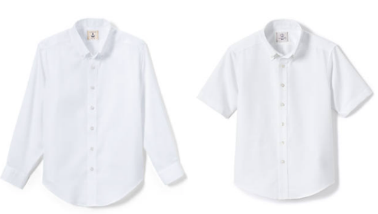
WHITE SHORT OR LONG-SLEEVED, COLLAR SHIRT WITH BUTTONS