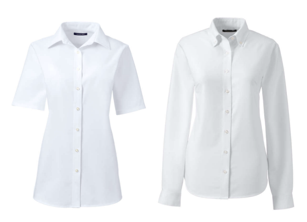
WHITE SHORT OR LONG-SLEEVED, COLLAR BLOUSE WITH BUTTONS