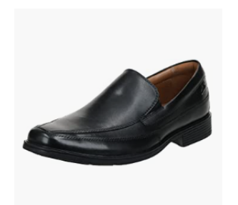
OXFORD OR LOAFER