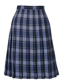
WOMENS LANDS' END PLEATED SKIRT BELOW THE KNEE (CLASSIC NAVY PLAID) SKIRT MUST FULLY COVER THE KNEE